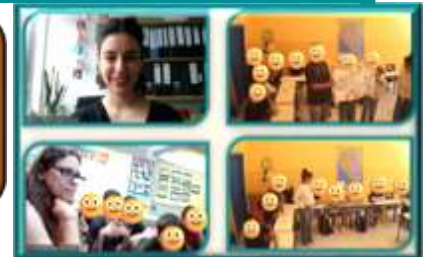
eTwinning Students Exchange Ideas