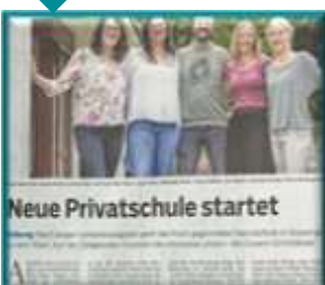
Germany's First Bioeconomy Pilot School Opens!

In September 2024, LENA (Lebendige Naturschule), Germany's first bioeconomy pilot school, opened with BioBeo's support. Emphasising outdoor and community-based learning, LENA integrates parental involvement, supported by Parents International. The BioBeo consortium looks forward to future collaboration. [Read More]