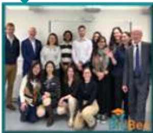
BioBeo BIP concludes with BISC-E National Winners!

The BioBeo Blended Intensive Programme concluded on March 8, 2024, with the BISC-E finals at Maynooth University. Students from Maynooth, Rotterdam, and Odisee explored bioeconomy integration. The University College Dublin team won with their anaerobic digestion and microalgae project, advancing to the European finals in September 2024. [Read More]