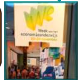
BioBeo at the Week of Economics Education